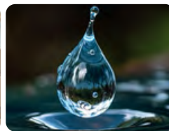
Minimising Use of Water