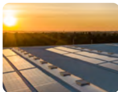
Solar Powered Warehouse Panels