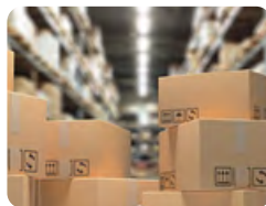
Reusing Shipping Containers